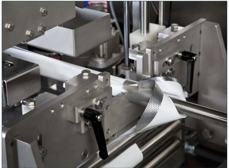
Economical flat roll stock film is formed into a cartridge.

Central to Rota-Clip's high production output is its use of economical roll stock plastic film. It forms and seals the film into a cartridge via a heat or glue seal system. This replaces previously used metal cans, composites, or premade cartridge containers enabling customers to reduce or eliminate expensive material inventory and supply issues.