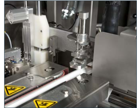
Continuous motion film drive moves the tube beneath the seal unit which applies heat or glue seals.