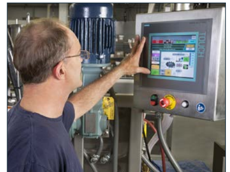
The Human Machine Interface (HMI) touch screen control system makes operation and performance analysis easy and intuitive.

Setup and operation are easy with PLC and user-friendly HMI touch screen control with integrated safety and motion control. Splicer, glue seal and clipper are all controlled from a single point. The operator can quickly maneuver through the large touch screen with detailed color graphics and evaluate the machine's performance checking every work step when needed, and clear screen messages provide essential communication. Standard controls store an unlimited number of recipes making product changeovers quick and efficient.