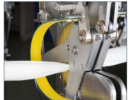
The seal gate gathers the filled tube and securely double clips it.