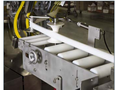
The sealed tube is filled with emulsified product through a constant output pump as it moves to the rotary table.