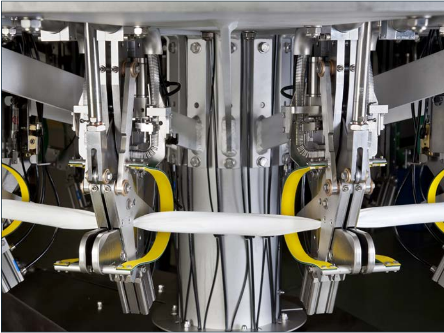
The Rota-Clip can produce over 330 sealed and clipped chubs every minute.